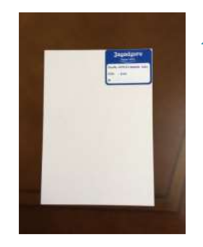
TOOTH PASTE PACKAGING